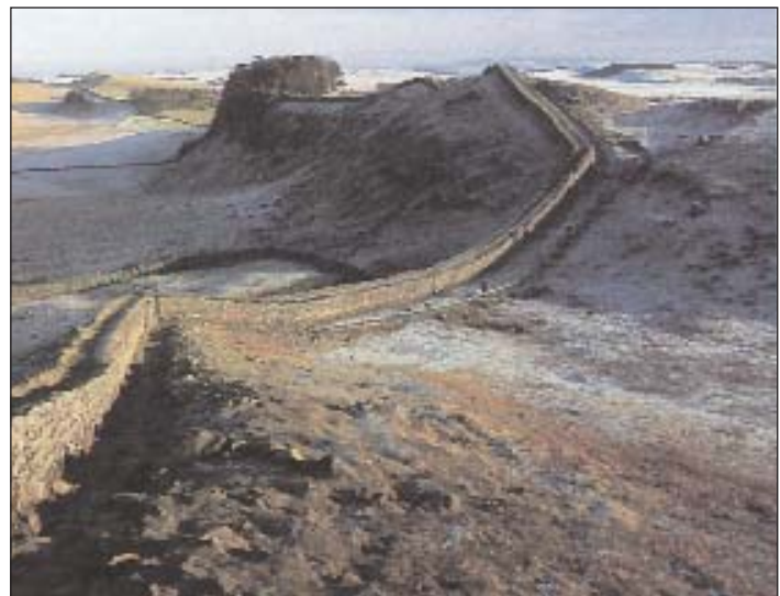
The central portion is the best surviving part of Hadrian's Wall. The view is looking east towards Housesteads fort.

The price of £99 includes coach travel from the pick-up points to the sites along Hadrian's Wall and return to the pick-up points, fully guided tours and entry fees. But the price does not include any meals or accommodation or travel from elsewhere to and from the Newcastle pick-up points.