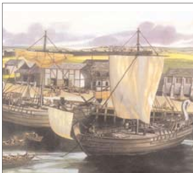
An artists impression (top) of how Arbeia Roman fort at South Shields would have looked in its heyday. The Roman harbour is situated below the fort in the mouth of the River Tyne (above) and Roman ships would have kept the supply base busy with food for Hadrian's Wall garrisons.

Cheques made payable to -'Kent Archaeological Field School'