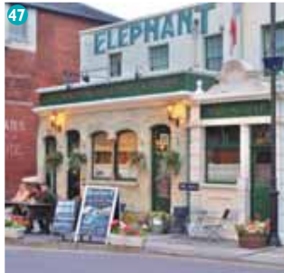
47 The Elephant – The Mall, Faversham, Kent ME13 7JN Tel: 01795 590157

Voted the Campaign for Real Ale's East Kent pub of the year 2010, and Swale CamRA pub of the year for the last four years. The only pub in Faversham making true use of its freehouse status, many ales are sourced locally earning it CamRA's LocAle accolade. Cask Marque has inspected and approved the quality of beer and ales served. With an open fire, music most weekends, an enclosed garden and function room we say, "Love beer? love the Elephant!"