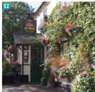
52 Rose & Crown – Perry Wood, Selling, Kent ME13 9RY Tel: 01227 752214 email: info@roseandcrownperrywood.co.uk www.roseandcrownperrywood.co.uk

One of the top five fish and chip shops in the London and Southeast Seafish Competition 2007. Located in the heart of Faversham, Ossie's is the only fish and chip shop in town open all day, providing you with fresh, quality ingredients, good service, good value and great food including healthier option fish cooked on the griddle. Open Mon-Sat 11am-10.30pm, Sun 12-9pm.